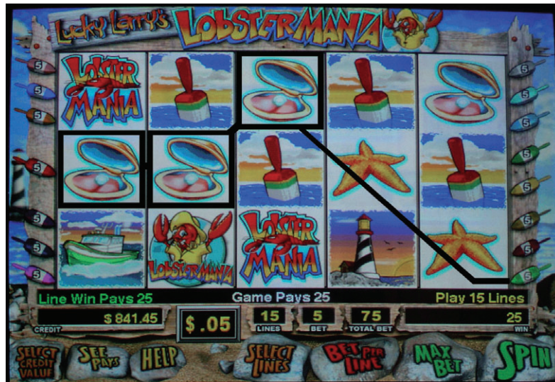
Figure 1 Video display of Lucky Larry's Lobstermania showing a loss disguised as a win

than following LDWs. For both wins and LDWs, however, the nature of the feedback is categorically similar; one always sees 'winning' symbols outlined, one always sees digits counting up in the 'win box' and one always hears the rolling sound as the win is counted up. Regular losses, by contrast, are categorically different from wins and LDWs in that no positive feedback occurs. It is this categorical similarity between wins and LDWs that led us to predict similar arousal responses for these outcomes.